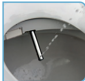
Posterior and feminine warm water washes