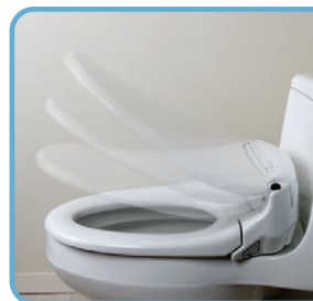
Gentle-closing seat & lid