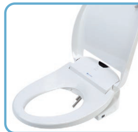
Contoured, heated seat

The Swash advanced bidet seat combines the latest innovation and design to keep you feeling fresh and comfortable.